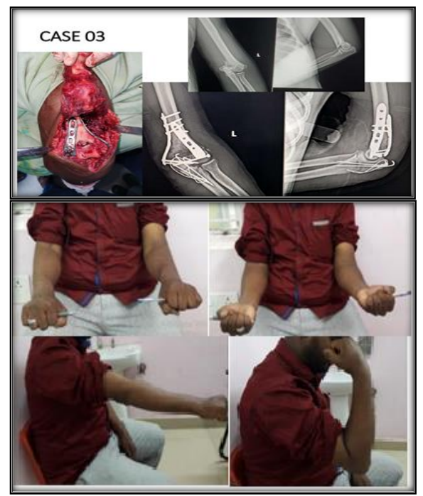
Range of movement – Pronation, Supination, Extension and Flexion.